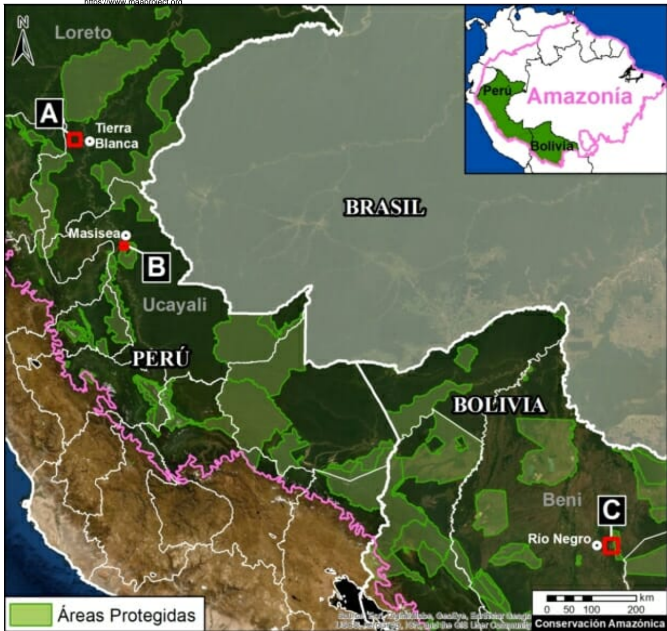
Base Map of Mennonite colonies in Peru and Bolivia. Data: MAAP.